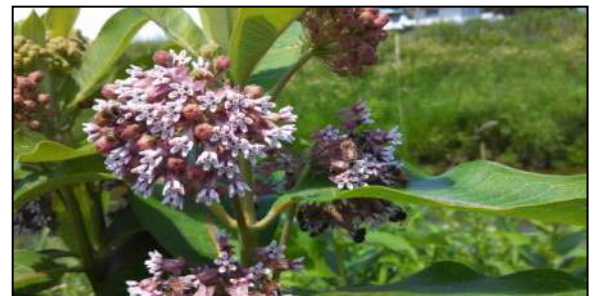
Monarch butterfly on blazing star.

The recommendations on how to establish and maintain a pollinator garden (below) are adapted from the Prairie Seeding Instructions from Prairie Nursery.