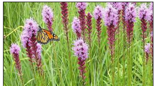
Honey bees on milkweed

Planting a pollinator garden on your farm is a long-term investment and requires a fair amount of planning.