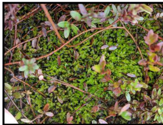
Image 2: Left: Grass emerging above the vines. Right: Sphagnum Moss greening up. 5-1-19 Tomah, WI

Herbicides are being applied in between rainfall and frost watch. In addition to pre-emergent herbicide applications, Sphagnum moss and grasses were being addressed the last week of April through the first couple weeks of May. (Image 2)