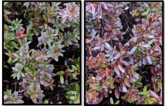
Image 1: Left: ST Vines Tomah, WI 5-1-19 Right: ST Vines Cranmoor, WI 4-29-19

The dormant color is slowly leaving the vines. The Warrens/Tomah area is a little ahead of the Cranmoor area in coloring up. The photos (Image 1) were taken of Stevens (ST) vines 2 days apart. Neither grower protected during the cold snap, which happened the end of April. You can see a huge color difference yet, the buds are both tight.