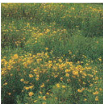
mature plant in cranberry bed