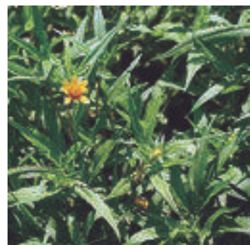
young plant starting to flower

flower: showy, yellow daisy-like heads, with broad, yellow rays and a darker yellow disk, often nodding; blooms August–October