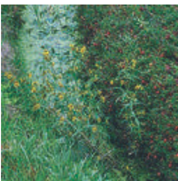
mature plant in cranberry bed